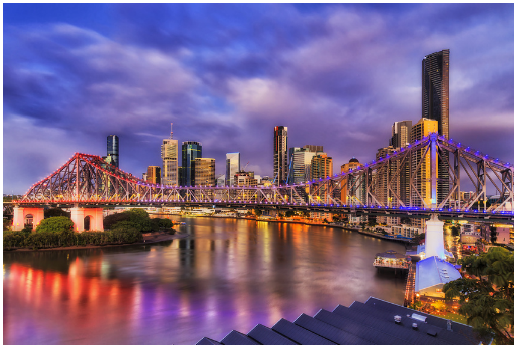
The Story Bridge in Brisbane, QLD - Australia.