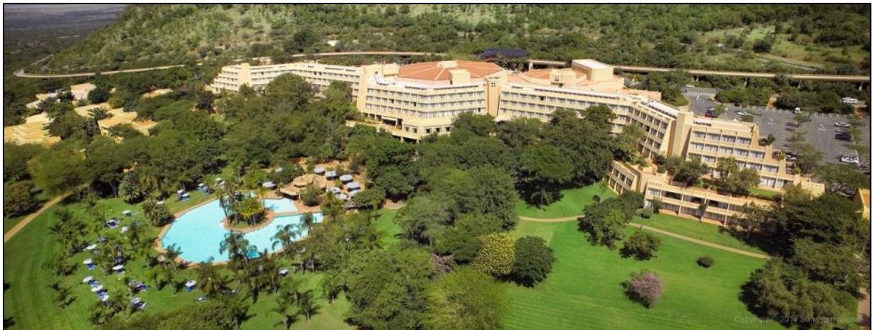
Soho Hotel in Sun City Resort