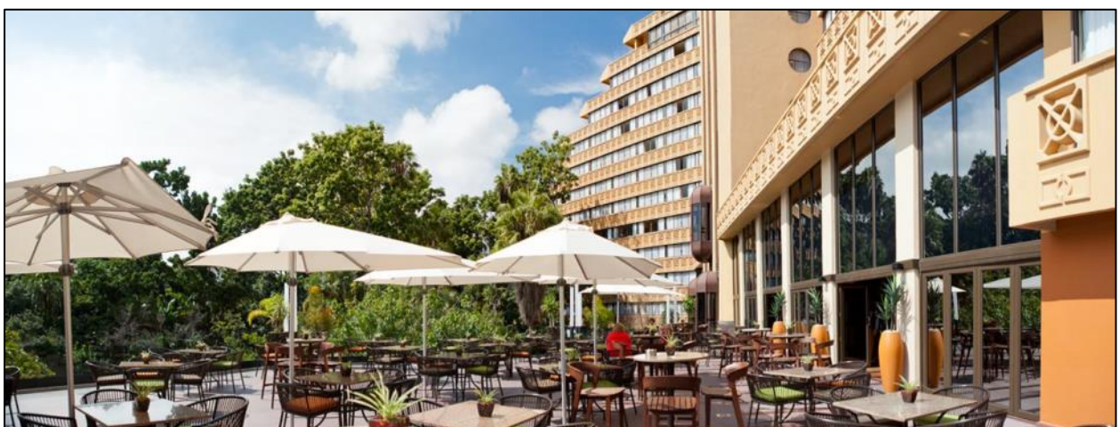
CASCADES Hotel in Sun City Resort