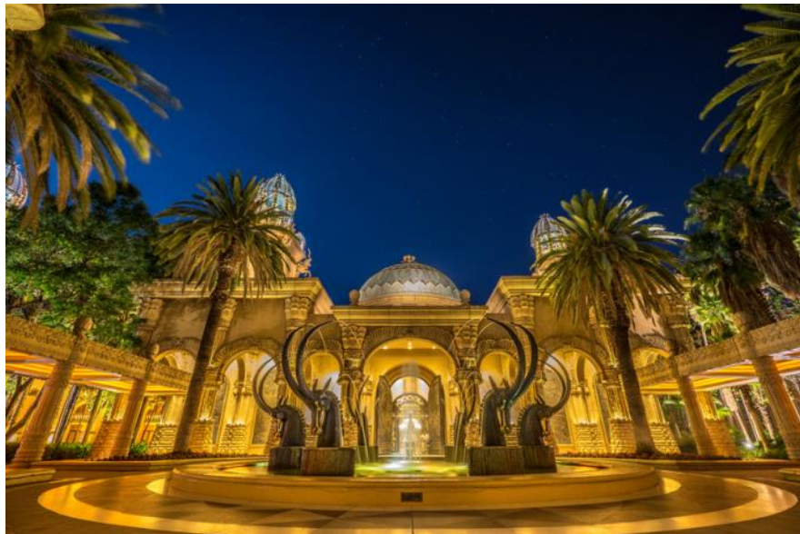
Sun City, South Africa